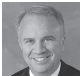
AL BRANDEL Chairperson, Lions Clubs International Foundation

Vision can also be preserved by adopting healthy behaviors. By not smoking, increasing your intake of antioxidants and omega-3 fatty acids, exercising and keeping your blood pressure under control you can take steps toward a lifetime of healthy vision.