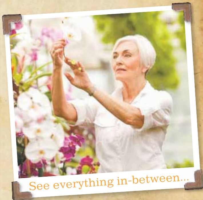
See everything in-between...

I'm so glad my friend told me about the ReSTOR® lens - hopefully my story can help you the way hers helped me.